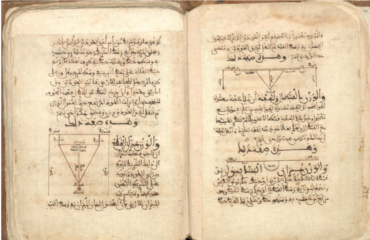
Figure 2. Illustration of murjiqāl from Ibn Luyūn Kitāb al-filāha (The Filāha Texts Project)

Convert’) from 1779. Osman Efendi’s mathematical treatise is the only book he wrote in Arabic. Hadiyyat al-Muhtadī is actually an elaborate personal work, going far beyond a simple translation of pre-existing works: While initially the work appears to predominantly be a careful blending of chapters of several European books, freely translated with additional commentary, Efendi also incorporated a wide range of non-European features into the book, seemingly largely taken directly from Islamic knowledge of the living tradition. Osman’s treatise is arranged in two parts, each divided into three books. Descriptions of instruments are to be found in five of these six books. In many cases, but by no means ubiquitously, they are accompanied by neat drawings. 26