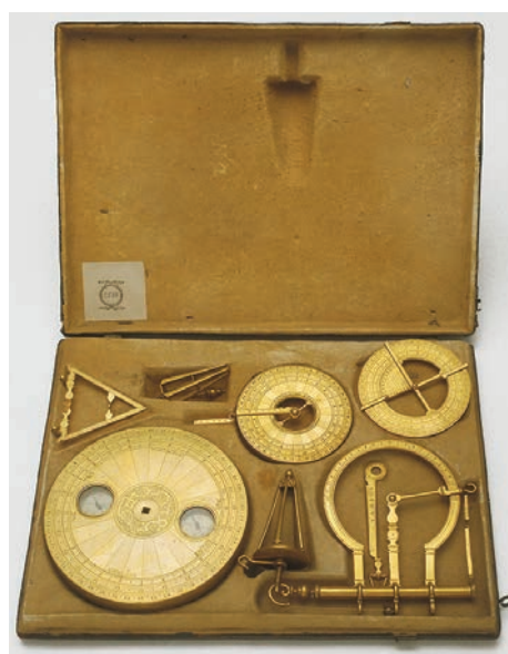
Figure 4. 16 th century surveying instruments box (Museo Galileo, Florence)

Porządku Stawowego y przestroóg niektórych domowego gospodarstwa (Fish Pond Management). These were the only three Polish-language treatises addressing the problems of leveling written prior to the 19 th century. Stroynowski preserved the text by Strumieński, but added more information on aquaculture and fish species. Strumieński's book has an extremely practical value; it is written in simple, clear language, and contains many technical notes that reflect the author's own experiences, as well as a detailed description of the instruments, and leveling and hydraulic engineering works. Strumieński focused on three instruments: the synbalance, archipendulum (rope-level) and water level. The example from our collection can be attributed to the type classified as an archipendulum; a level balance consisting of a metal triangular plate. The plumb bob was suspended centrally along the side, on the string, to cover the check hole near the bottom apex of the triangle when level. 37 It is not known what the sources were for the compilation of Polish treatises in the 16 th century, but it is most likely that they were medieval Andalusian works, which reached Central and Eastern Europe via the Jewish community after its exodus from Spain.