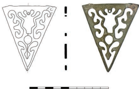
Figure 1. Level from Museum in Doboj

taut between the two poles. The person holding the first pole placed it in position, and the other person lowered or raised the other end of the cord until the plumb line was positioned in such a way that the plumb bob ( şākūl ) stopped oscillating, indicating that the cord was a straight horizontal line, marking the two points as level. The person carrying the first pole noted the place indicated on the pole by the cord to measure any difference in height, and then moved in the chosen direction to continue the leveling. Thus, builders were able to measure a slope with a value. 5