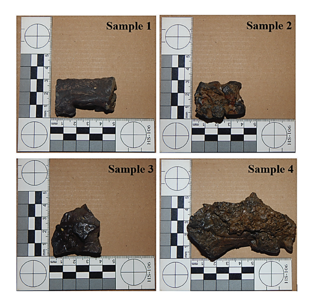
Fig. 4. Slag samples used for the analysis in this paper

performed by atomic absorption spectrophotometry (AAS) technique, on instrument VAR-IAN 240 FS. Standards used were from Merck (Cd, Cr, Co, Mn, Ni, Zn and Ag), Panreac (Cu, Pb) and Carl Roth (Fe). Standard analytical error for Cd, Mn, Ni, Zn was \pm 2 \text{ mg/L} ; \pm 5 \text{ mg/L} for Cr, Co and Zn; \pm 0.002 \text{ g/L} for Pb and Cu; \pm 0.2\% for Fe. The results of the analysis are expressed as the weight percent of cobalt, chromium, nickel, copper, manganese, silver and cadmium oxides and the weight percent of iron, lead and zinc.