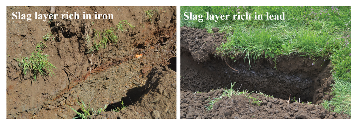
Fig. 3. Profiles of the slag layers from which samples were exempted

Four massive samples of slag from different depths and profiles of trenches were chosen for the analysis. Grinding of these samples was carried out in the laboratory of Faculty of Natural Sciences and Mathematics (Sarajevo), Chemistry department, Chair of Analytical chemistry. For the final assay 0.5 g of each sample was taken with accuracy at \pm 0.1 mg. Samples were prepared according to the modified procedure after Olovčić et al.<sup>30</sup> Fig. 4. shows the slag samples